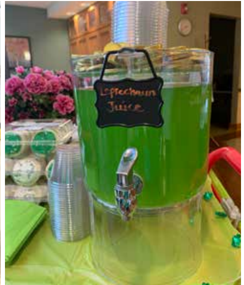
Green Kool-Aid aka Leprechaun Juice