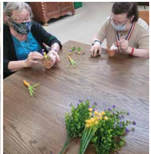
Almost done.. now where's that rabbit?