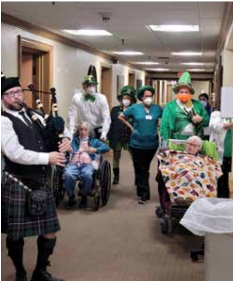
Parade through the hallways