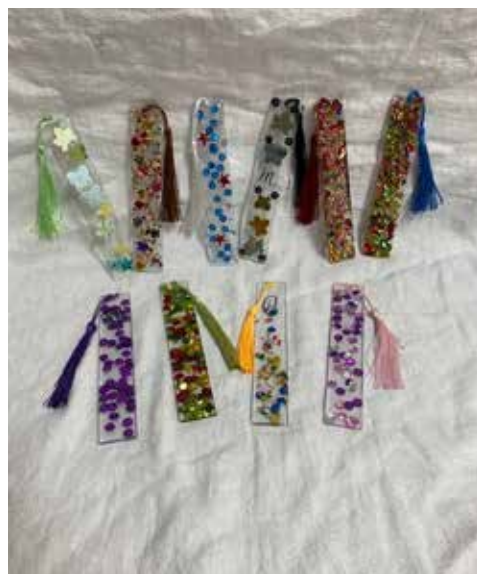
Who wouldn't want one of these lovely bookmarks?