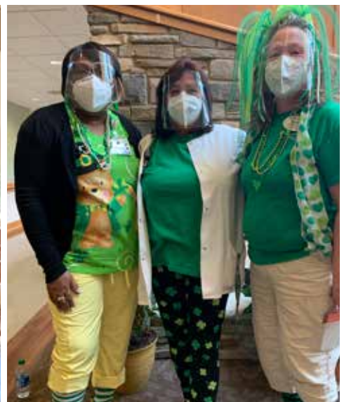
We are all Irish on St. Patrick' Day