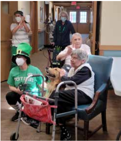
Nothing better than a parade (with a front row seat)