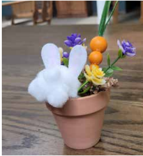
The finished craft