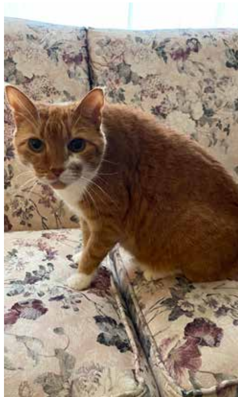
Socks the Cat – So Cute!