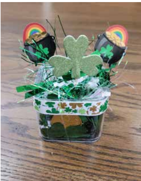
Such a cute centerpiece