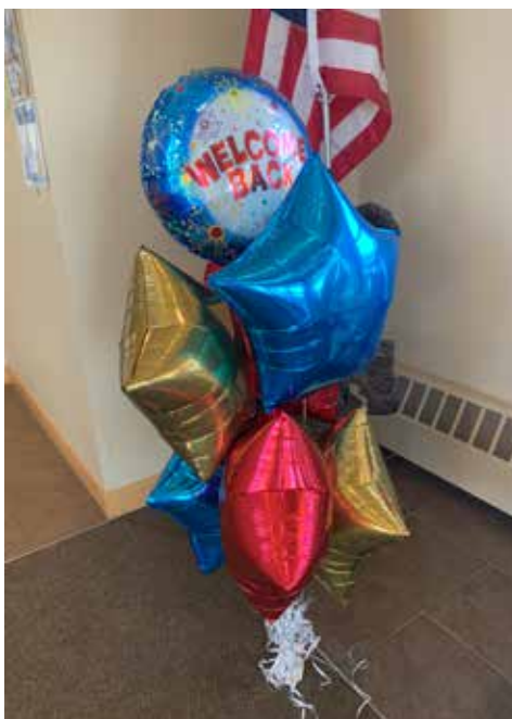
Welcome back balloons!

Last week, indoor visitation restrictions were lifted for our nursing home and assisted/independent living residents, with visits taking place in the residents' rooms. Though we are excited for our residents and families to be reunited once again, we are cautiously optimistic and ask all visitors to please be respectful of the guidelines set in place by the two main government entities – CMS (Centers for Medicare and Medicaid Services) and ODH – Ohio Department of Health. All visits must be registered through SignUp Genius (links were sent to the responsible party of each resident via email – also on our website – annamariaofaurora.com ). No walk-ins or non-scheduled visits permitted. As vaccinations continue to increase, our hope is that our doors will be wide open once again, soon.