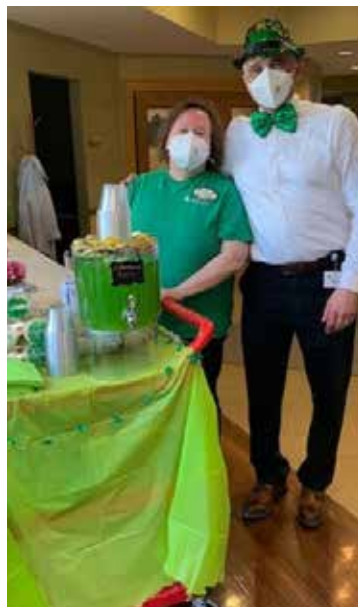
Leprechaun juice anyone?