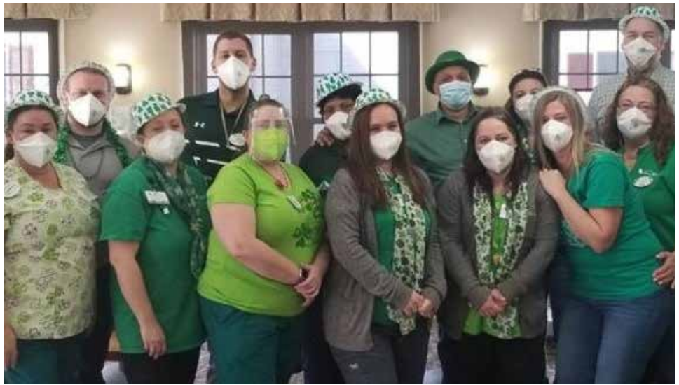
The Kensington crew looking good in green!