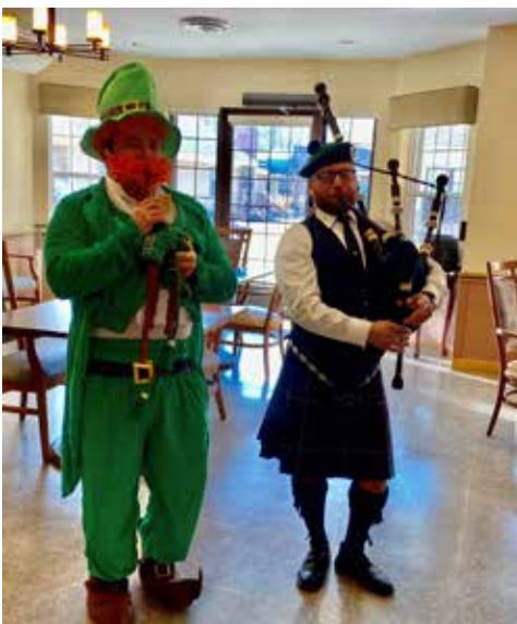
Who is the professional bagpiper?