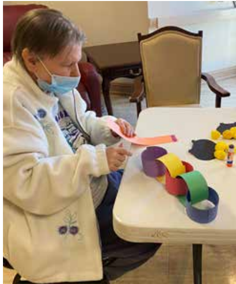
Kensington resident works on a rainbow