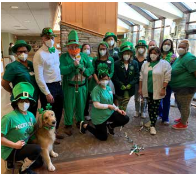
The Anna Maria crew