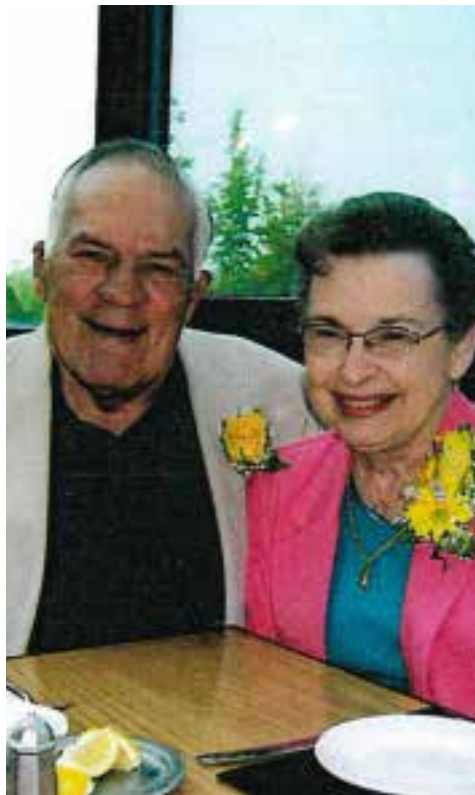
50th Wedding Anniversary