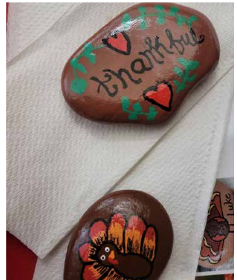
Residents did a nice job on the rocks