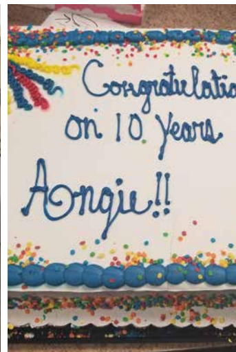
What a lovely cake!