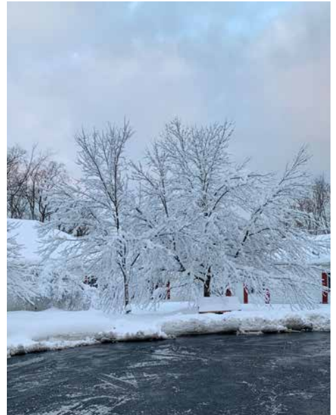
Bowie loves the snow!