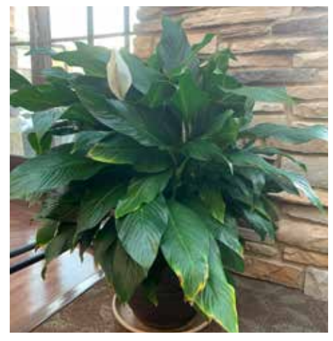
What kind of plant is this?