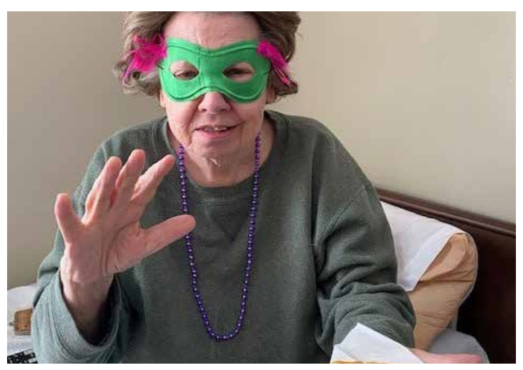
Can you guess the resident behind each mask?