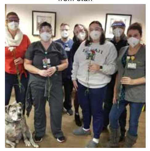
The Kensington gang