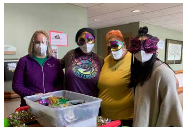
Anna Maria activities staff ready to pass out beads!

Did you know that Mardi Gras is French for Fat Tuesday, reflecting the practice of the last day of eating rich, fatty foods before the ritual 40 days of fasting during the Lenten season? This day is also known as Shrove Tuesday, or here in Cleveland, it's commonly known as Paczki Day! A paczki is a most delicious, deep-fried donut filled with jelly or cream. Popular Mardi Gras practices include masks, costumes, the ever-popular beads, and of course lots of sweets! Though our celebrations this year were slightly different due to Covid, residents still enjoyed a safe, fun-filled afternoon.