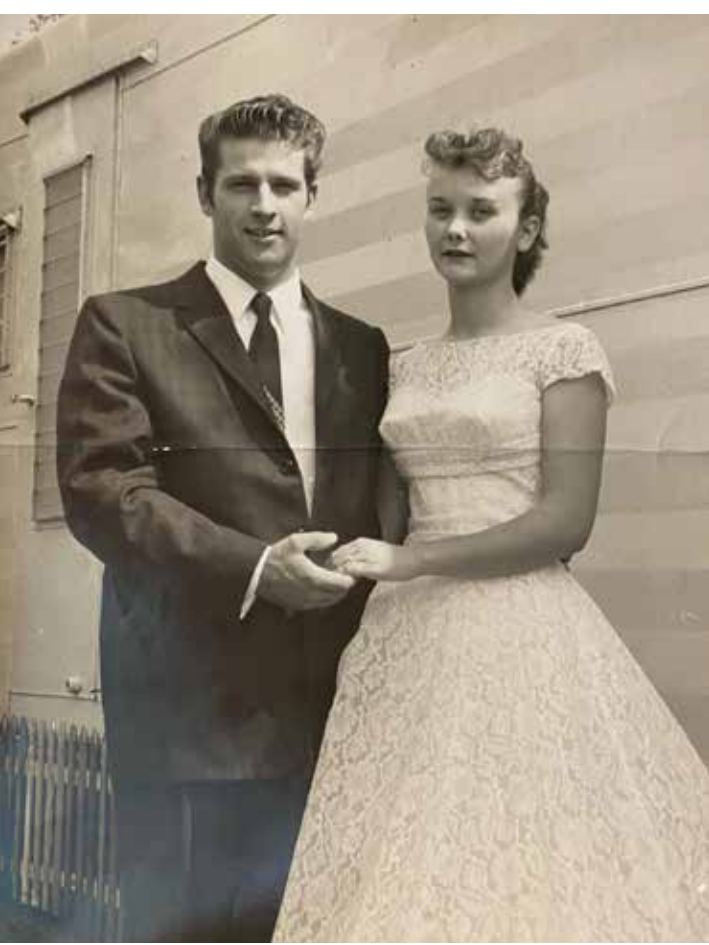
Still in love after all these years...