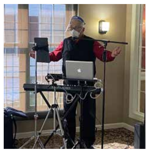
Valentine's Day entertainment