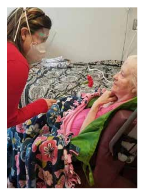
Kensington residents each received a lovely red carnation from staff