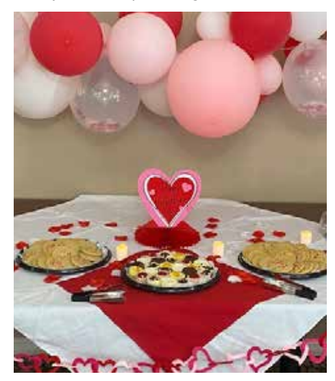
What a wonderful spread!