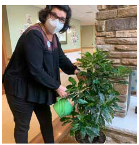
Time for a little water and TLC