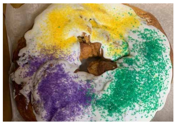
King cake - so delicious