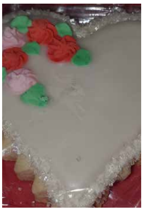
Each resident received a Valentine cookie