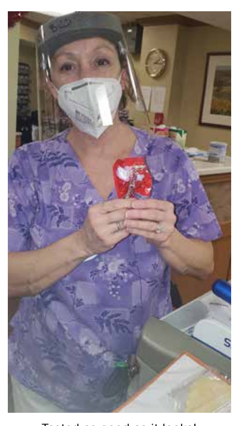
Tasted as good as it looks!