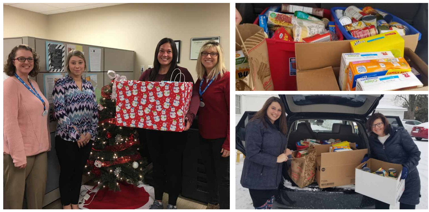
Family Tree Home Care with one of the collection boxes