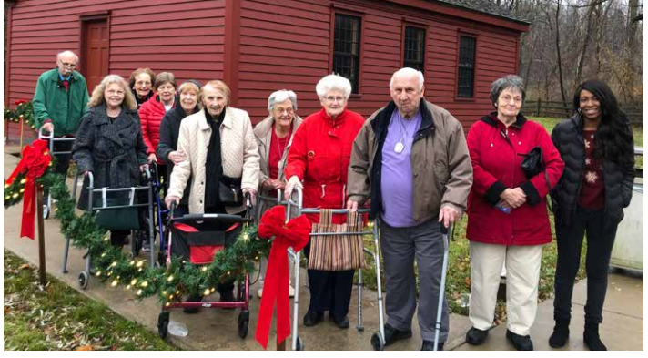
The group really enjoyed this exhibit