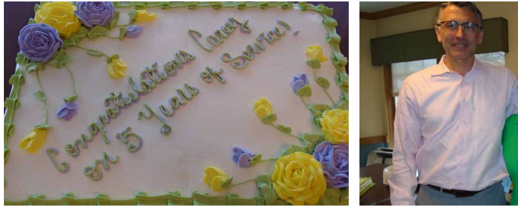
Tasted as good as it looks!