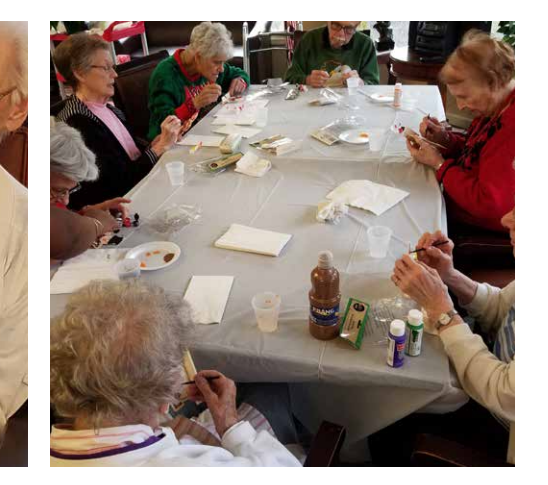
Busy, busy, crafting, crafting

Assisted living residents had a ball bringing wooden snowmen and candy cane ornaments "to life" with a variety of different-colored paints. Too cute!