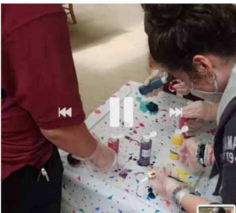
Busy, busy, busy