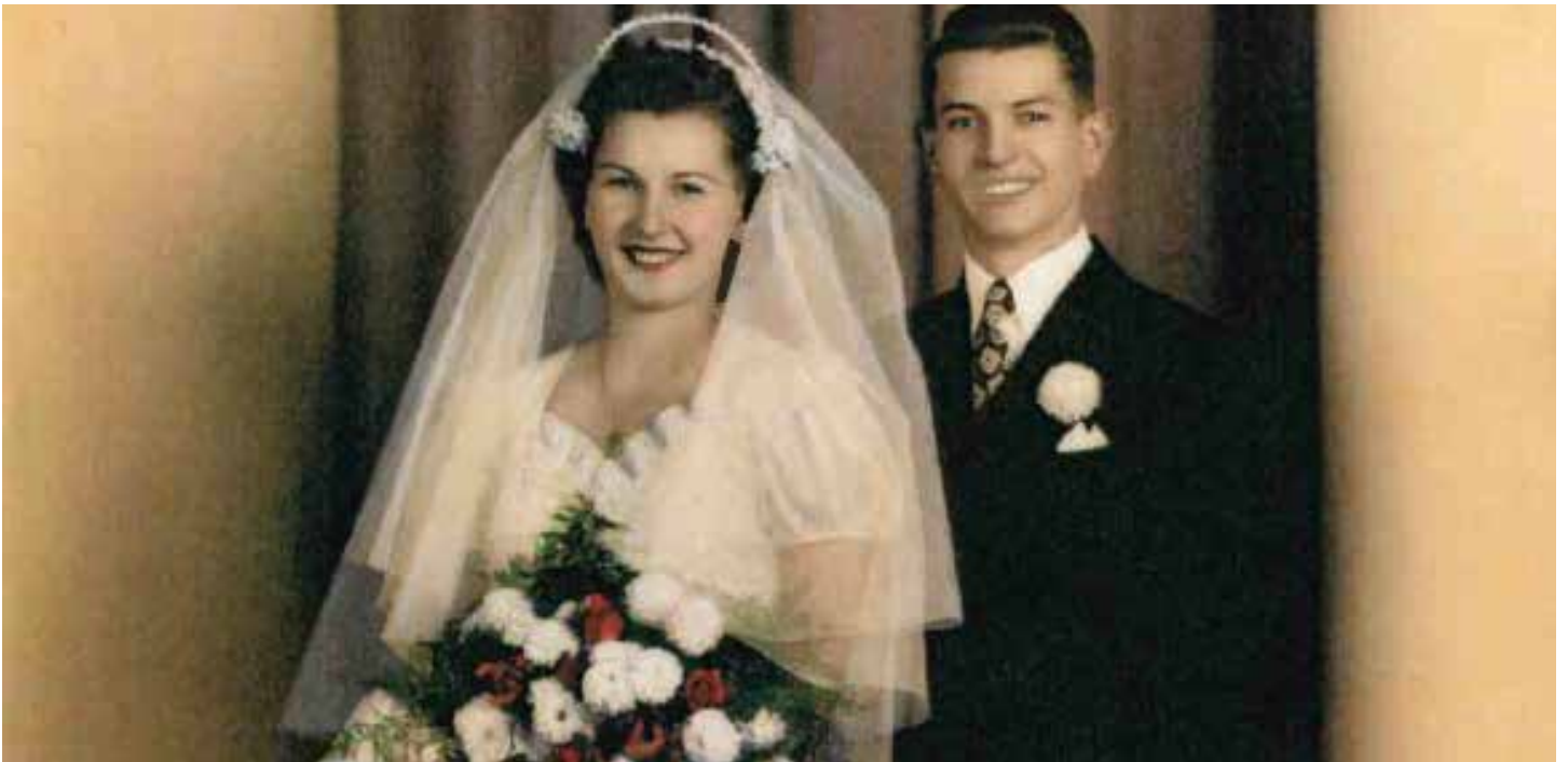
What a beautiful wedding picture!